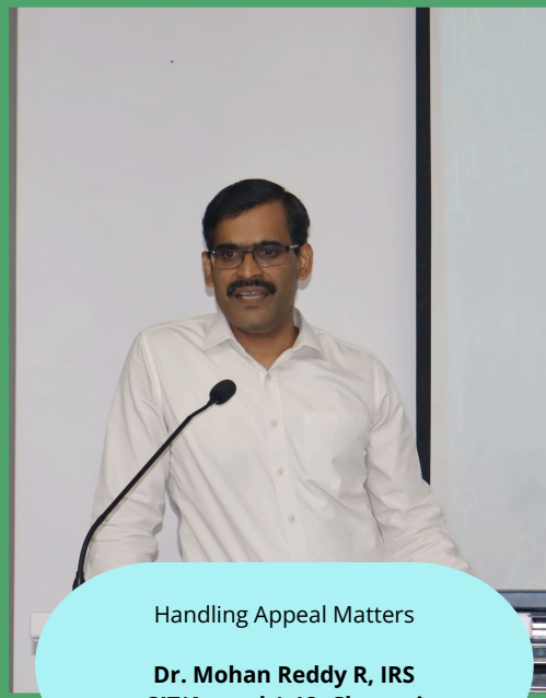
Handling Appeal Matters