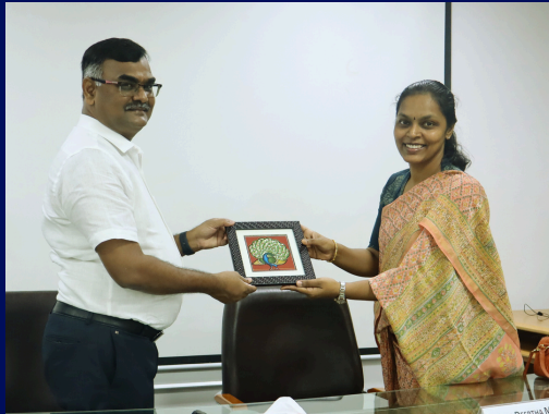
Inaugurated by Shri M. Rajan, IRS, CIT (Appeals)-19, Chennai.

The 40-day Orientation Programme for 36 newly promoted Income Tax Officers commenced on 03.07.2025. The programme was inaugurated by Shri M. Rajan, IRS, CIT (Appeals)-19, Chennai. It is designed as per the New National Training Syllabus so as to equip the newly promoted Income Tax Officers with knowledge and practical orientation required for the post of ITO. The topics covered aimed to enhance the Domain, Functional and Behavioral competencies of the participants. Eminent faculties being subject matter expert handled the sessions.