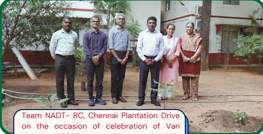
Team NADT- RC, Chennai Plantation Drive on the occasion of celebration of Van Mahotsav, 2025 at Hostel Garden of NADT- RC, Chennai .