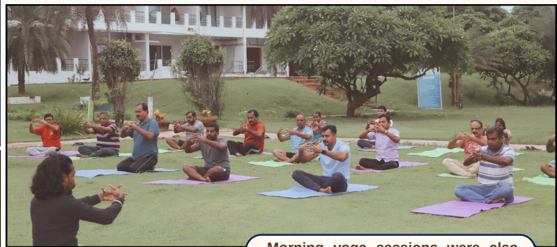
Morning yoga sessions were also conducted, focusing on physical fitness, mindfulness, and stress management.