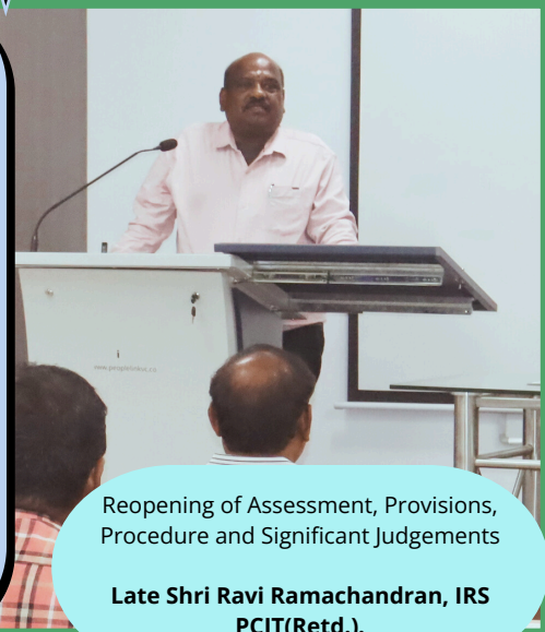
Reopening of Assessment, Provisions, Procedure and Significant Judgements

The course was organized from 18.08.2025 to 19.08.2025 covering key aspects of the role of a JAO, including Demand Management, Interplay between ITBA & CPC 2.0, Audit Management, Grievance Redressal, Reopening of Assessment – Provisions, Procedure & Significant Judgements and Handling of Appeal Matters. A total of 44 participants from Tamil Nadu & Puducherry region and Kerala region attended the session.