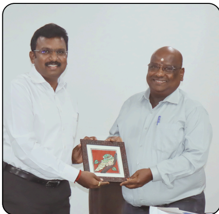
Exit Tax and Donations, Condonation of Delay, General Public Utility by Specified topics were curated and delivered by Late Shri Ravi Ramachandran, PCIT(Retd.), Chennai.

The sessions included theoretical and practical perspectives, checklists, case studies, case laws etc. that were handled by subject matter experts. Overall the participants found the sessions to be greatly beneficial.